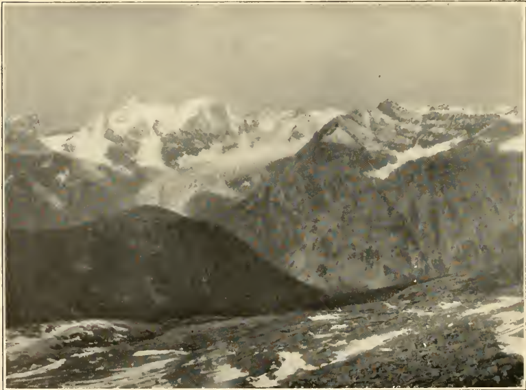
"MUMMERY" ON BAKER PASS.